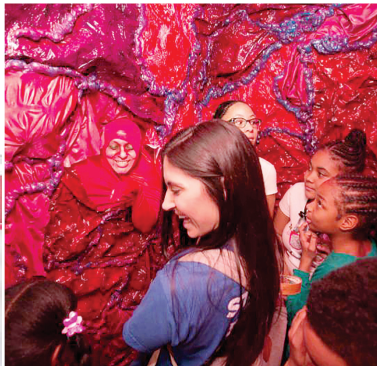
The Chicago Children's Theatre will transform its new West Loop home, The Station, into an all-immersive, two-story theatrical environment, totally unique to Chicagoland, for the world premiere live theater event An Epic Tale of Scale .